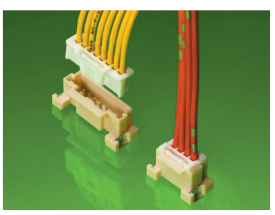
Molex's line of DuraClik connectors has expanded to include a new vertical version