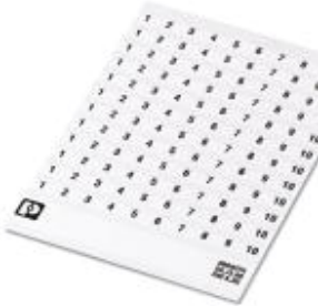
Marker cards, white, Mounting type: Adhesive, For terminal block width: 6.2 mm

Please be informed that the data shown in this PDF Document is generated from our Online Catalog. Please find the complete data in the user's documentation. Our General Terms of Use for Downloads are valid ( http://download.phoenixcontact.com )