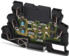
Spring cage modular terminal block with integrated surge protection, for assembly on NS 35/7.5, voltage U_{N} 24 V DC, terminal width: 6.2 mm, cover width: 2.2 mm

Please be informed that the data shown in this PDF Document is generated from our Online Catalog. Please find the complete data in the user's documentation. Our General Terms of Use for Downloads are valid ( http://download.phoenixcontact.com )