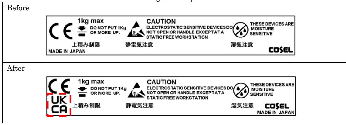
Fig. 3 Sample 3

BRFS, BRDS, BRNS, CBS, CDS, CES, CHS, CQHS, CQS, DBS, DHS, DPF, DPG, MG, MH, SFCS, SFLS, SFS, SUS, SUW, SUCS, SUCW, SUTS, SUTW, TUNS, TUHS, TUXS, VAF, SNDBS, SNDHS, SNDPF, SNDPG, SNTU, STMG