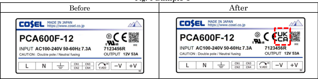
Fig. 1 Sample 1

ACE, AME, KH, KL, KR, LHA, LHP, PBA300F to 1500F, PCA, PJA, PLA, PJMA