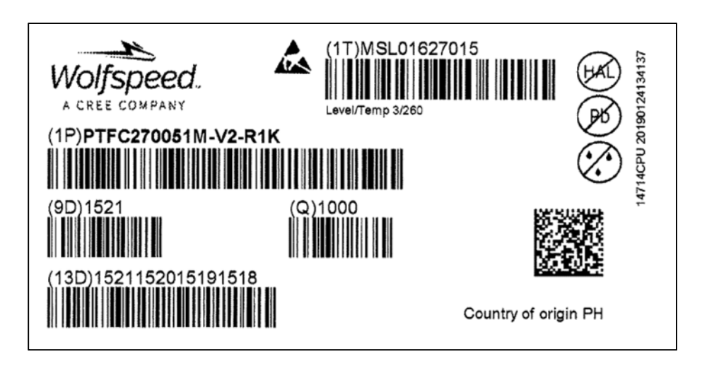
Figure 1 – Label on the exterior of the shipping container

Individual Tray or Reel Label (Figure 2)