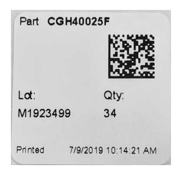
Figure 2 – Label on the individually bagged trays or reels.

Tray and Reel labels (Figure 2) include a bar code. The bar code is in the format: %$<part>$<lot>$Q<qty$%. For the example label below, the read-out is %$CGH40025F$M1923499$Q34$%