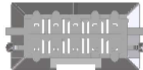
Bottom view of connector