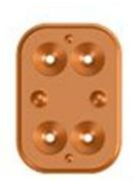
OLD DESIGN Used in 33472-04xx & 33472-44xx