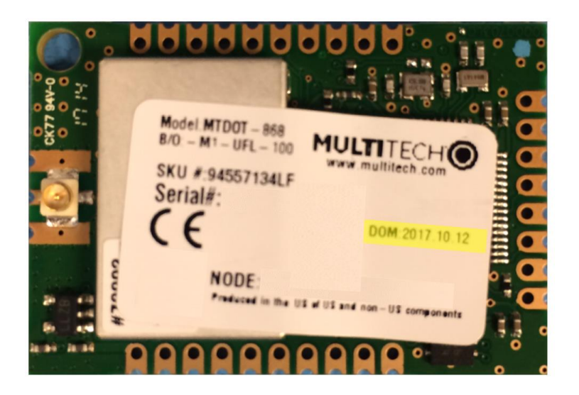
ATTACHMENT 3 Dot AT Command Firmware Versus mPower Software and mLinux Software

Model Number: MTDOT-868-M1-UFL-100 Example: DOM 2017.10.12 = October 12, 2017