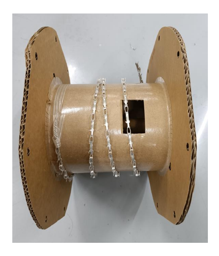
Fixed of FIBER TAPE