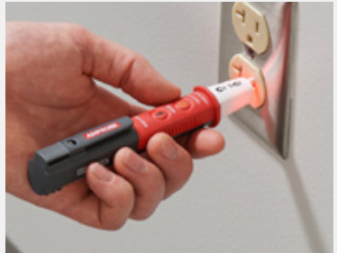
Test wall sockets for AC voltage