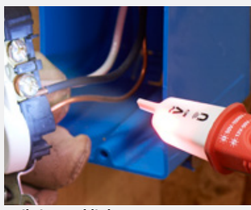
Built-in worklight (NCV-1030, NCV-1040)