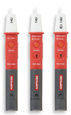
NCV-1000 Series Non-Contact Voltage Probe

The Amprobe NCV-1000 Non-Contact Voltage (NCV) tester series provides maximum safety and convenience for detecting AC voltage without interrupting electrical systems. Designed to conveniently fit in your shirt pocket, the NCV-1000 series performs in indoor and outdoor settings. Safety tested to the highest category measurement, CAT IV 1000 V, as well as IP65 water and dust resistant, the NCV-1000 series is fit for the toughest industrial applications.