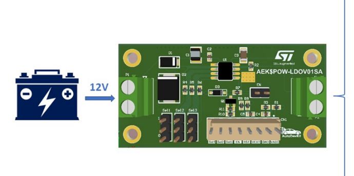
Figure 1. AEK-POW-LDOV01S block diagram