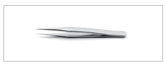
M2-SA 3 1/2" 90 mm Flat sharp fine tips