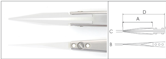
73MZ.SA A 1.4" 35 mm - B 0.012" 0.3 mm - C 0.04" 1.0 mm - D 1.9" 50 mm _ Replaceable tips set code: A73MZ