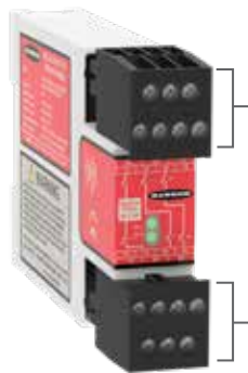
IM-T-9A and IM-T-11A