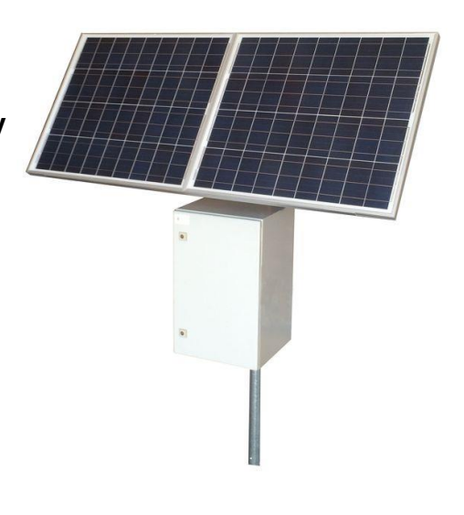
160W / 320W Solar Mount