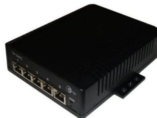
TP-SW5G-D (802.3af/at) TP-SW5G-NC TP-SW5G-MULTI TP-SW5G-24 (802.3af/at)