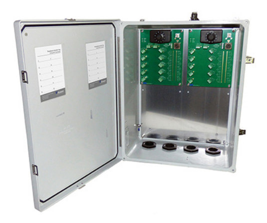
Expandable size: 12-48 channels