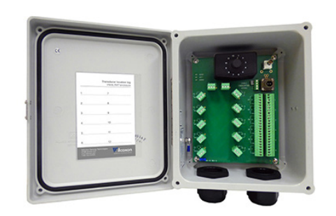
Standard size: 1-12 channels

VLS enclosures handle up to 48 inputs of standard IEPE sensors. The variety of configuration options allows users to choose exactly what's needed for any application. VLS models feature a data ready LED indicating that sensor BOV levels have stabilized, minimizing data collection time and helping ensure reliability. For online monitoring, optional terminal strip connectors are available.