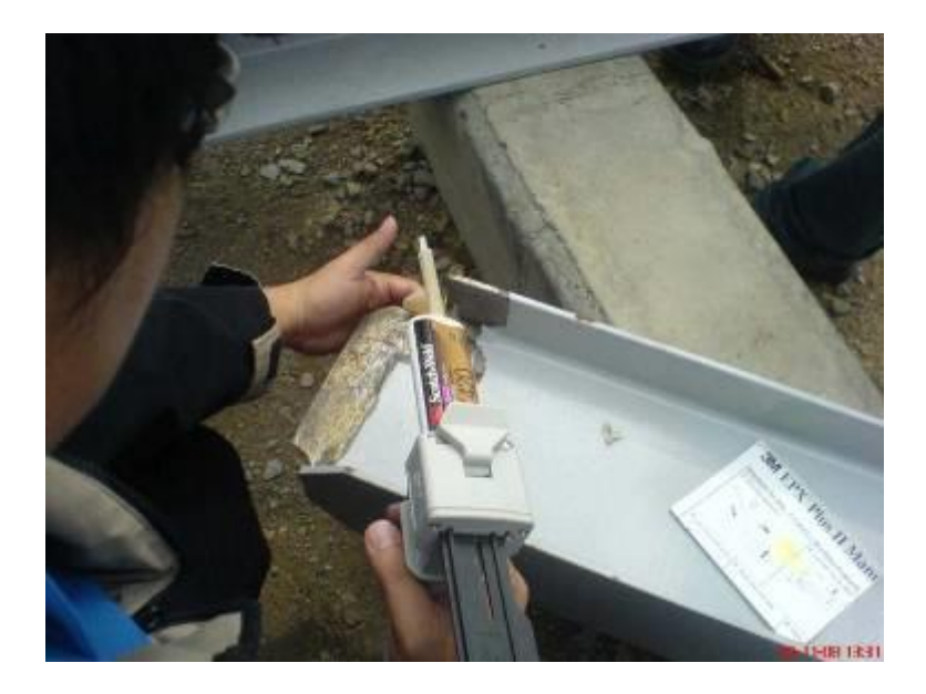
Figure 4: handheld 3M^{TM} EPX Plus II applicator containing a duo-pak cartridge with attached static mix nozzle.

Typically, two part adhesives can be supplied in bulk systems, such as 5 gallon pails or 55 gallon drums, and used with a meter/mix system; they may come packaged in hand-dispensable cartridges with the two components side by side (as in the 3M<sup>TM</sup> EPX Duo-Pak system) which assist in proper ratio-ing and mixing, or may come in small cans or tubes which require manual measuring and mixing of the parts. The two-part 3M<sup>TM</sup> EPX Duo-Pak system features two side-by-side cylinders appropriately sized to provide the right mix ratio, and disposable static mix nozzles that ensure proper mixing in use. A variety of hand-held applicators are available as well (see picture below).