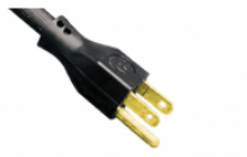
5-15P Straight Blade