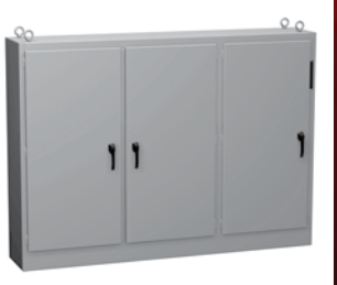
UHD Heavy Duty Disconnect Enclosures