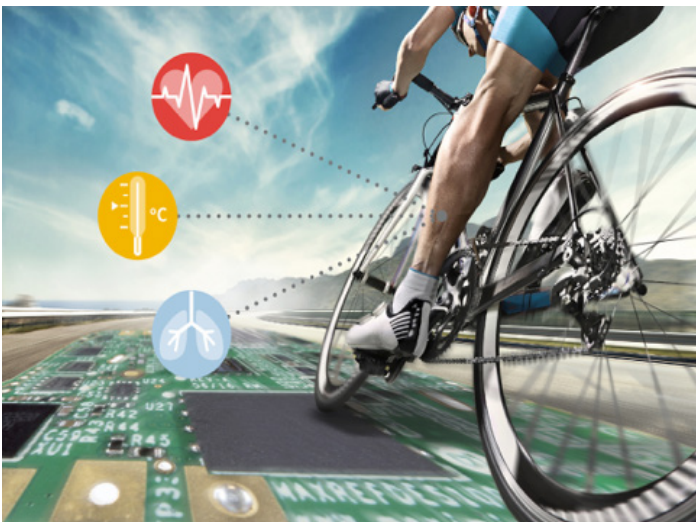
Figure 1. Wearable Health and Fitness

In addition to providing physicians with useful health information, wearable devices offer many benefits, such as player safety assessment, workout injury prevention, physical conditioning and performance metrics, and overall wellness awareness.