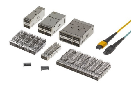
zQSFP+ Interconnect System