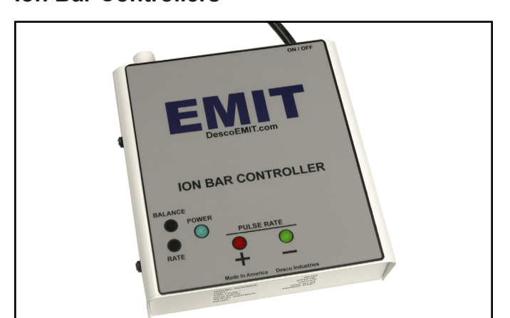
Figure 4. EMIT 50940 Controller with Recessed Potentiometer Adjustment