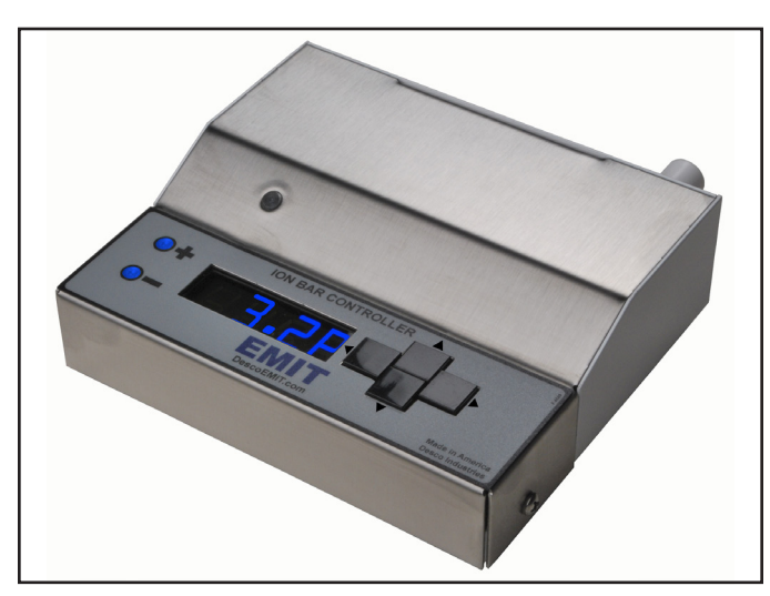
Figure 1. EMIT Pulsed Ion Bar Controller