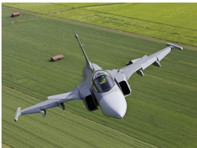
Flame resistance, strength, and low weight make Flexo® PPS sleeving the first choice in high-tech aeronautic design specifications.