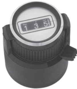
23-1-21 Projecting L. 31.5 mm