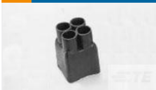
TE Part #034084-001 F133-200-FR