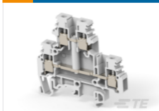
TE Part #1SNA115166R1100 M4/6.D1