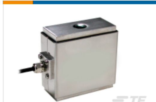
TE Part #EFN31-100N-C20005 FN3148-100N-/SC