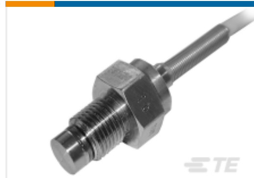
TE Part #EXPC1-100BS-C00002 M10X1 mV Miniature Pressure Transducer