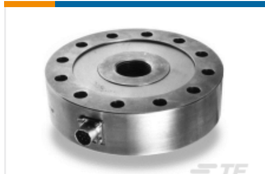
TE Part #20018780-00 Load Cell up to 200,000 Lb, FN3000