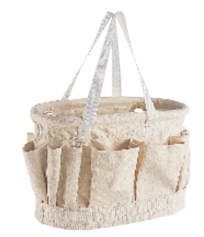
24-42 Bag Only 24-42S Bag & Two S Hooks 13 Outside Pockets, Web Handles 2 Grommets for S Hooks 15" X 7" x 10"