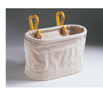
24-40S Bag & Two S-Hooks 15 Inside Pockets, 2 Grommets for Hooks 15" X 7" X 10"