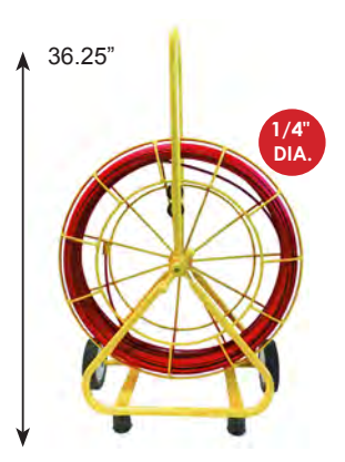
DUCT HUNTER™ 1/4"

New Jameson pre-loaded replacement reel improves the speed and safety of swapping out damaged conduit rod.