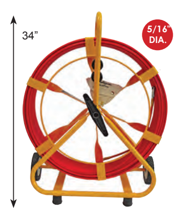
DUCT HUNTER™ 5/16"