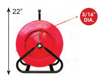
MINI DUCT HUNTER™ 3/16"