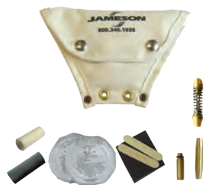
1/4" Duct Hunter Accessory Kit