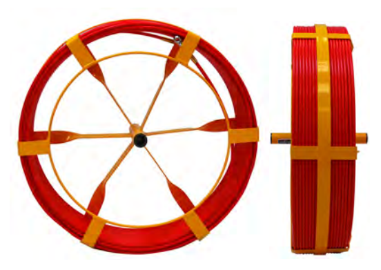
Duct Hunter Reel Replacement

However, on occasion it may be necessary to replace the entire spool of rod due to more severe damage. Removal, disposal and rod replacement can be a difficult and time-consuming task. Responding to customer feedback, Jameson introduced EZ-REEL™ pre-loaded replacement reels which help improve speed and safety of replacing damaged rod material.