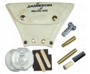
5/16 & 7/16" Duct Hunter Accessory Kit