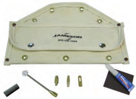
1/8" & 3/16" Mini Duct Hunter Accessory Kit