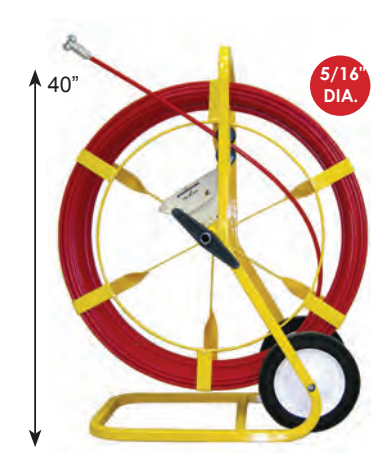
DUCT HUNTER™ 5/16"